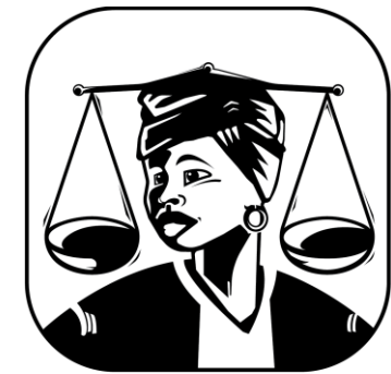
National Prosecuting Authority South Africa